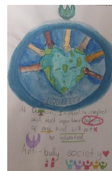
Year 6 - Emilia