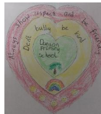
Year 2 - Vedanshi