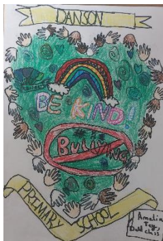
Year 4 - Amelia