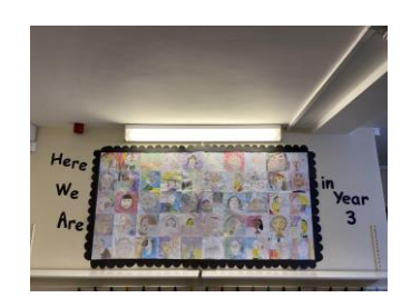
Year 3 have settled back in

really well this half term. In English, we have been writing instructional texts about how to wash a woolly mammoth. It proved to be as difficult as it sounded! In maths, we have been learning all about number and place value. We were paying close attention to the value of all digits in three-digit numbers up to 1,000. We also developed our written addition and subtraction methods with numbers up to three digits.