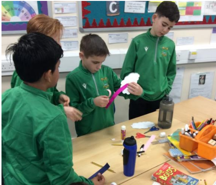
Making ways to wellbeing clouds

Throughout the school we took some time to think about what mental health means, and we discussed and participated in some activities which can support our mental health, we also thought about the importance of labelling and discussing our emotions with a trusted friend or adult. In EYFS and KS1, we wrote some positive affirmations to celebrate all of the things that are amazing about us! In KS2 we learnt about the 5 ways to wellbeing; connect, be active, take notice, learn new things and give. We wrote things that we do day to day that represent these 5 ways of wellbeing.